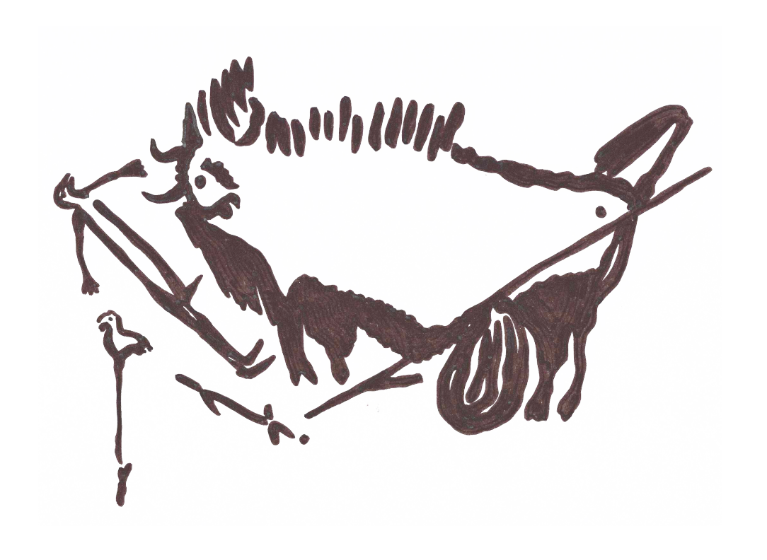
Le Puits in the Lascaux Cave (France)